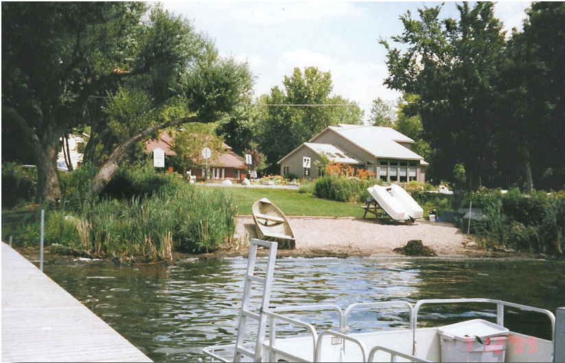
Another example of a beach blanket is pictured above.

©2012 State of Minnesota, Department of Natural Resources. Prepared by DNR Ecological and Water Resources. Based on Minnesota Statutes 103G, Public Waters Work Permit Program Rules Chapter 6115.