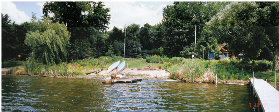
Beach blanket at shoreline.

Keep in mind that you are not allowed to install any plant barrier or liner (e.g., filter fabric or plastic) underneath your constructed beach. If owning lakeshore property with a sandy beach is a high priority for you, look for lakeshore property where sandy beaches occur naturally before you make that important purchase.